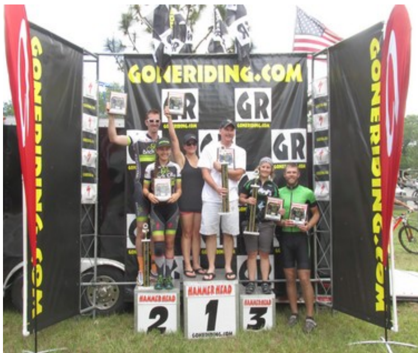
2016 Hammer Head 100 - Landbridge Trailhead - Ocala, FL 4-17-16 .

Written by David Monday, 03 April 2017 00:00