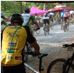
2012 12 Hours of Dauset