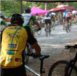
2012 12 Hours of Dauset