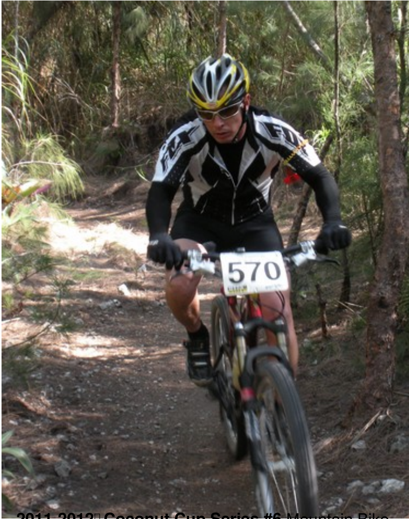
2011-2012 Coconut Cup Series #6 Mountain Bike